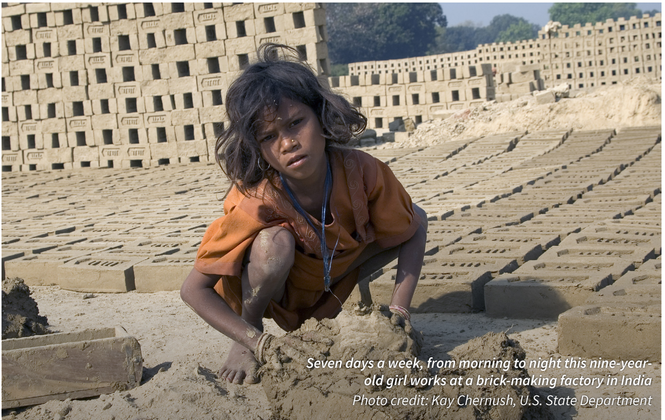
Seven days a week, from morning to night this nine-year-old girl works at a brick-making factory in India

Victims of modern slavery will often exhibit signs of anxiety and fear. They may be prevented by their employers from speaking to third parties without someone present. Victims may not even know where they are or how much time has passed since they arrived.