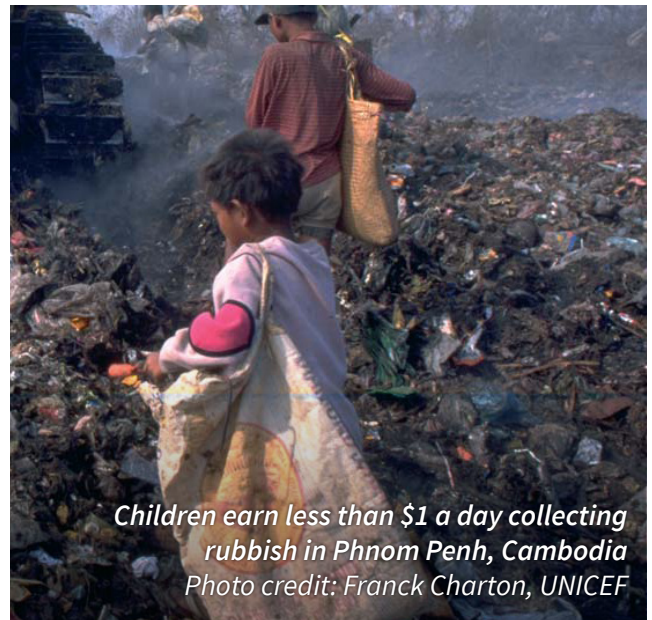
Children earn less than $1 a day collecting rubbish in Phnom Penh, Cambodia