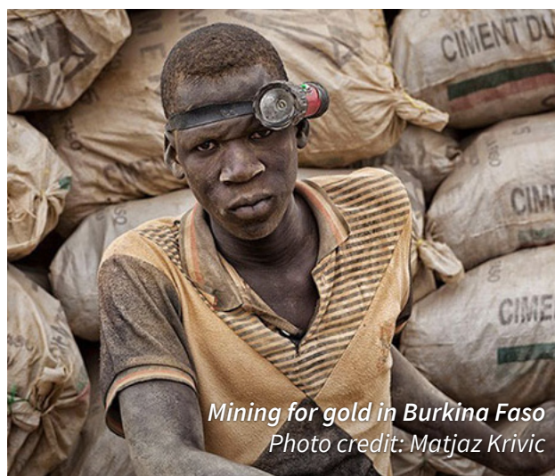
Mining for gold in Burkina Faso

of the victims are subject to sexual exploitation