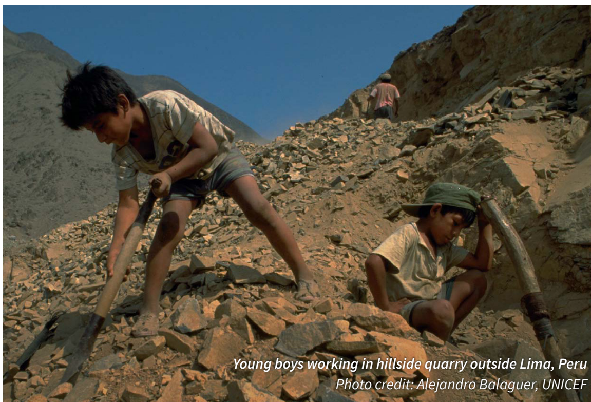
Young boys working in hillside quarry outside Lima, Peru

This free guide from VinciWorks will help your organisation comply with the new law and draft a slavery and human trafficking statement.