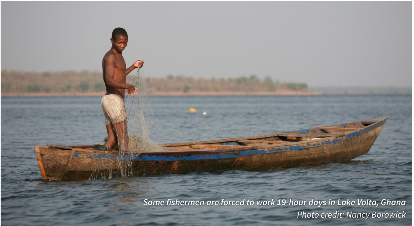
Some fishermen are forced to work 19-hour days in Lake Volta, Ghana

Where workers are sub-contracted throughout the supply chain. This may happen without the knowledge of your organisation and may occur